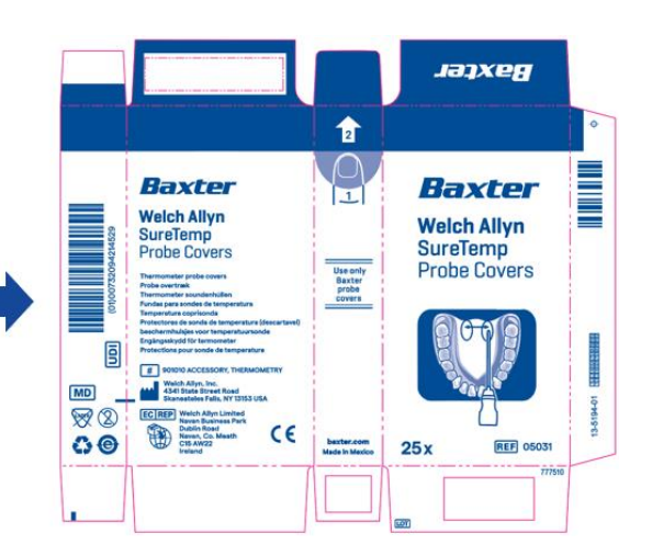
250x case box