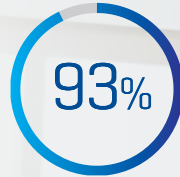
SINGLE-READ SUCCESS RATE

In addition to determining the percentage of successful blood pressure readings, researchers also analyzed the accuracy of those readings. During this study, the device's blood pressure algorithm demonstrated consistency between readings, even when movement was present, producing 85-87.5% of readings in a range of +/- 10 mmHg as compared to the manual device for the systolic and diastolic.