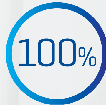
SECOND-READ SUCCESS RATE