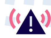
ALERT & ALARM MANAGEMENT