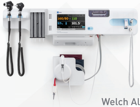
Welch Allyn Connex Integrated Wall System