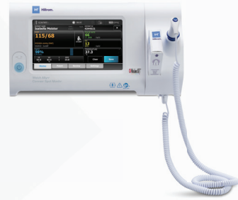
Welch Allyn Connex Spot Monitor