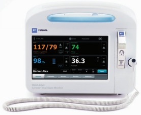
Welch Allyn Connex Vital Signs Monitor