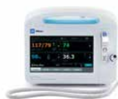
Welch Allyn Connex Vital Signs Monitor